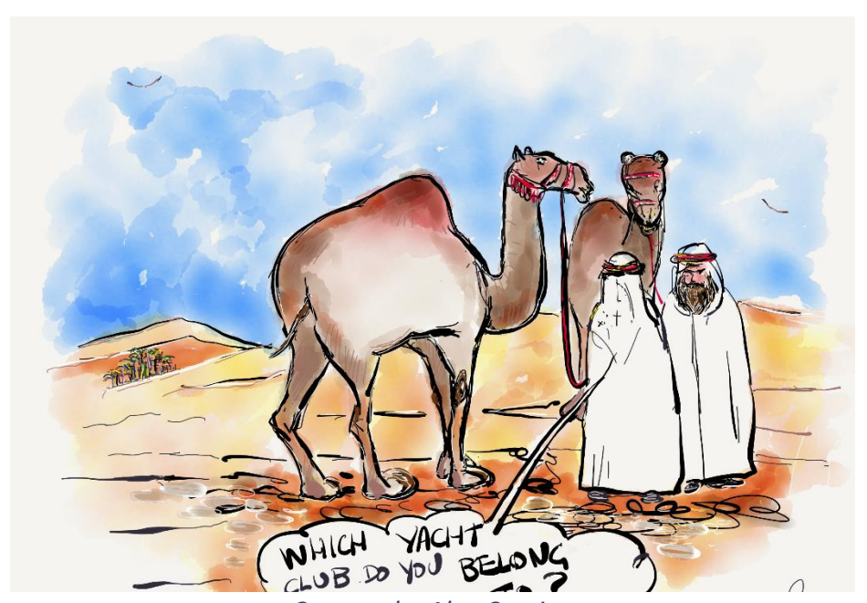
Cartoon by Alex Comino

Remember it is a "free" ride to Tassie even if they keep you up all night. Enjoy your next cruise on someone else's boat.