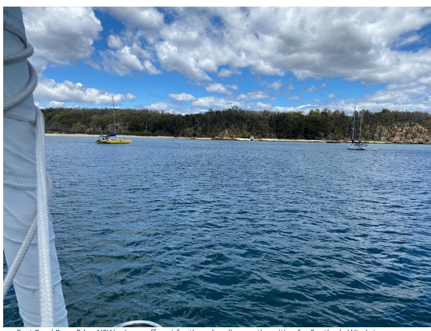
East Boyd Bay - Eden NSW – Jump off spot for those heading south waiting for Southerly Winds to ease

NEXT MEETING: MONDAY FEBRUARY 15TH 7:30 P.M. B.Y.O. BBQ 6:30 P.M.